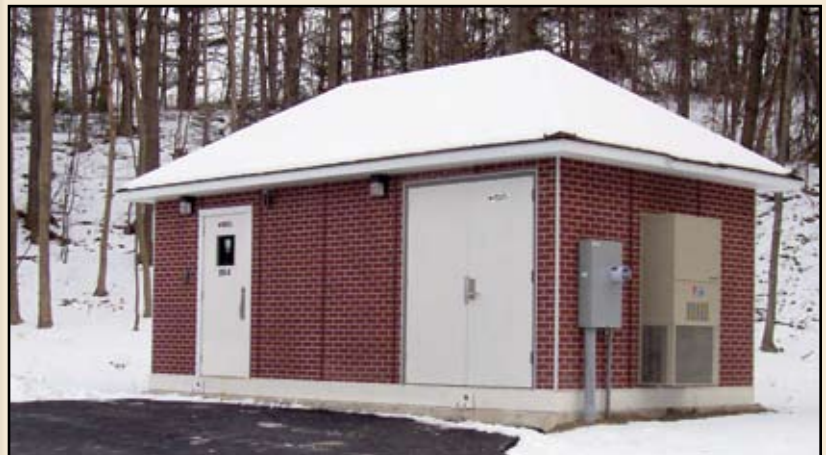
Improves the appearance of a jobsite, eliminating any eyesores.