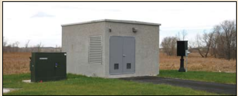
Attractive designs allow you to place system anywhere.