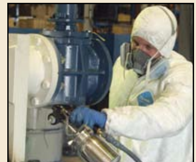
Superior design and craftsmanship ensure your complete satisfaction.