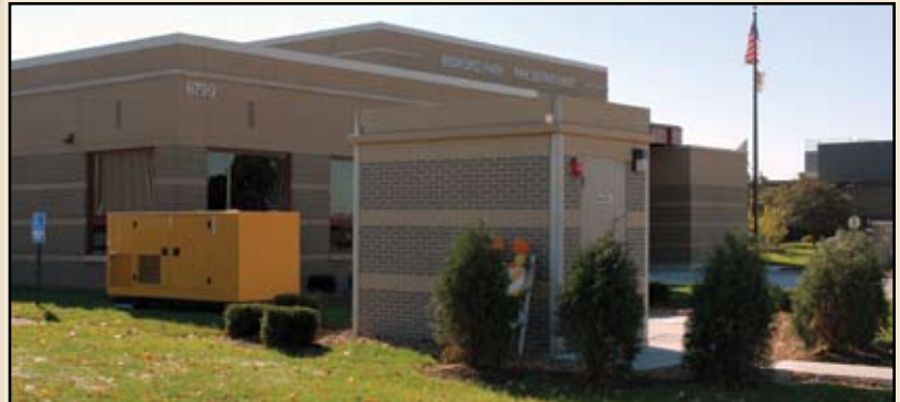
Choose from a variety of facades that “blend in” with any landscape.