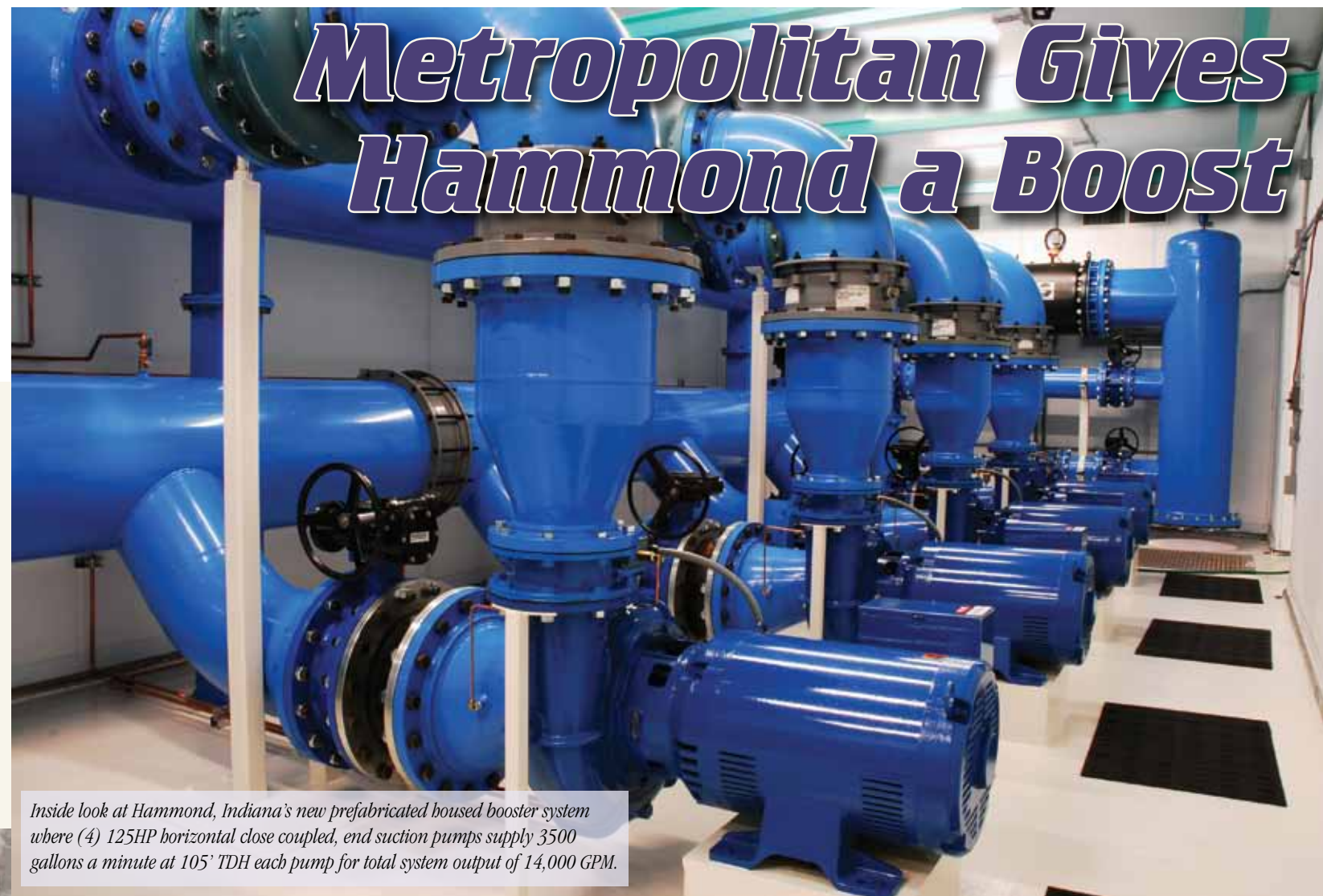
Inside look at Hammond, Indiana's new prefabricated housed booster system where (4) 125HP horizontal close coupled, end suction pumps supply 3500 gallons a minute at 105' TDH each pump for total system output of 14,000 GPM.

Metropolitan Industries achieved a milestone recently with the delivery of the largest prefabricated housed booster system ever designed and manufactured by the company to the City of Hammond, Ind. that will increase flow capacity for nearby residents by pressurizing the potable water from Lake Michigan.