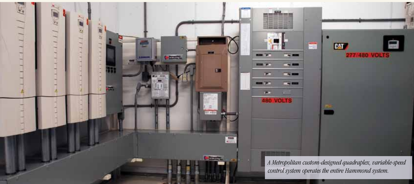
A Metropolitan custom-designed quadraplex, variable-speed control system operates the entire Hammond system.