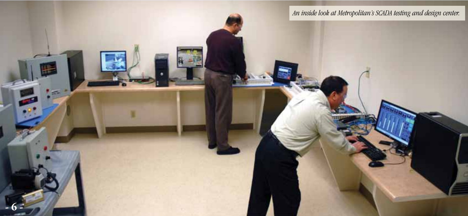
An inside look at Metropolitan’s SCADA testing and design center.