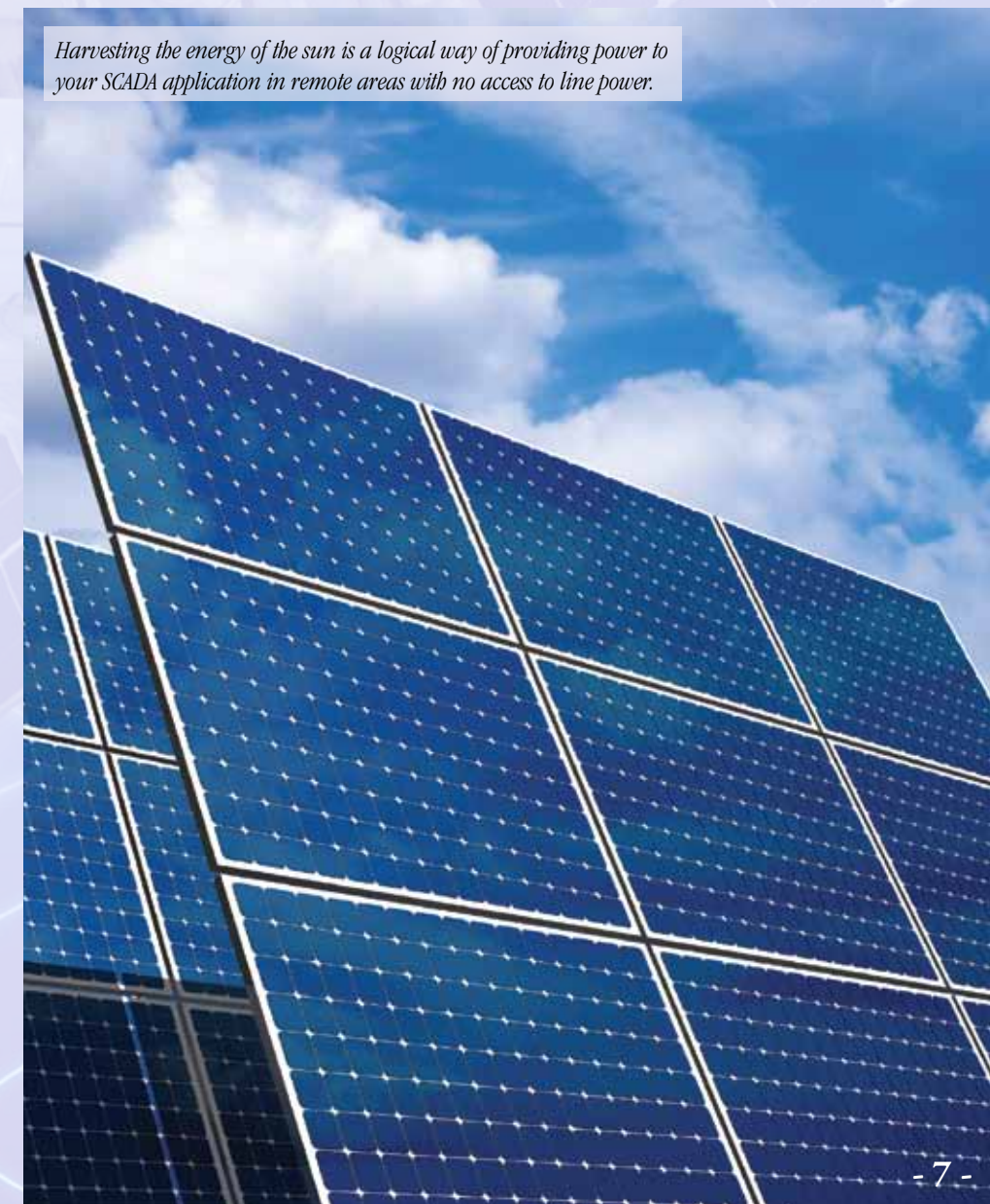
Harvesting the energy of the sun is a logical way of providing power to your SCADA application in remote areas with no access to line power.

As you can see from the two case studies, SCADA communication technology has advanced rapidly over the last two decades and is expected to advance further in the future. The future of SCADA lies in surveillance technology. Given the security measures taken at water sites after the attacks of 9/11, surveillance will surely increase monitoring capabilities which will increase security overall. For more information regarding this article, please contact Wayne Barkley or Joe Burza at 815-886-9200.