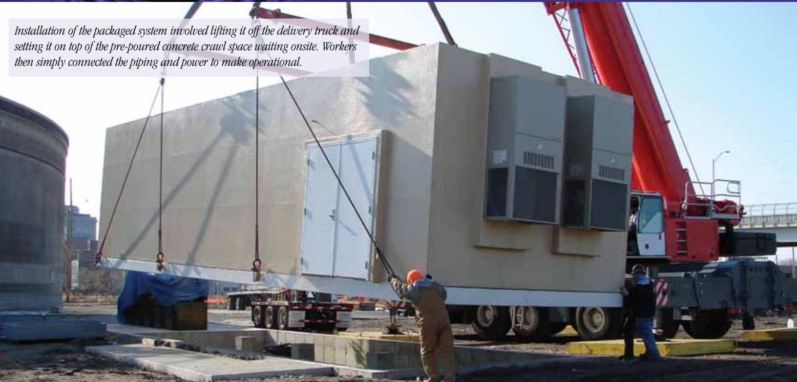
Installation of the packaged system involved lifting it off the delivery truck and setting it on top of the pre-poured concrete crawl space waiting onsite. Workers then simply connected the piping and power to make operational.