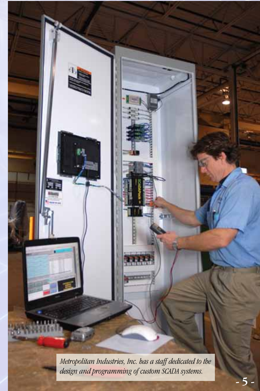
Metropolitan Industries, Inc. has a staff dedicated to the design and programming of custom SCADA systems.