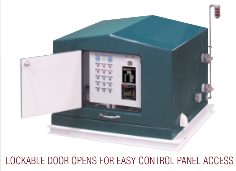
LOCKABLE DOOR OPENS FOR EASY CONTROL PANEL ACCESS