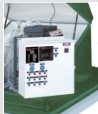
Swing-out control panel